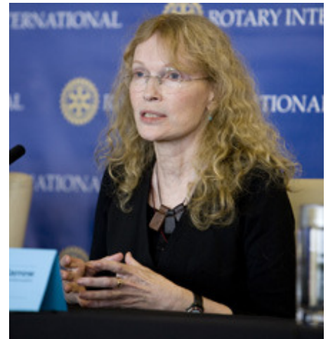
WORLD POLIO DAY: Actress and activist Mia Farrow, who was a speaker at the 2009 RI Convention, survived polio as a child.